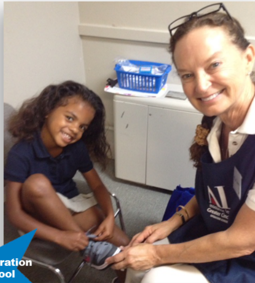
Operation School Bell