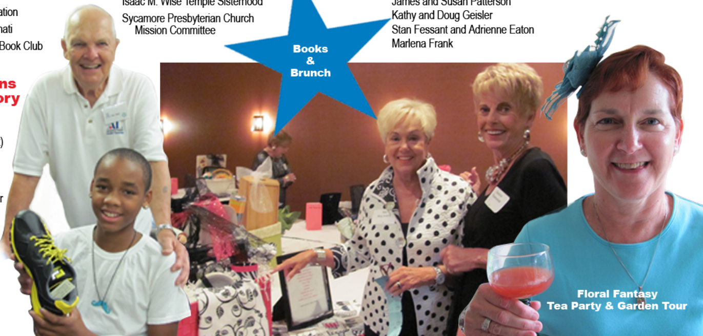
Floral Fantasy Tea Party & Garden Tour